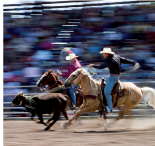
Rodeo, March 2 to March 21