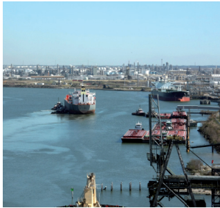
Port of Houston

Don't know where to begin? Start at the City of Houston Visitors Center at City Hall for hundreds of ideas on enjoying your time in Houston. The staff can help you plan your visit, suggest new things to do with your evenings and weekends (even to City residents) or help you bring your convention or meeting to this exciting city.